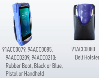
91ACC0079, 94ACC0085, 94ACC0209, 94ACC0210: Rubber Boot, Black or Blue, Pistol or Handheld 91ACC0080 Belt Holster