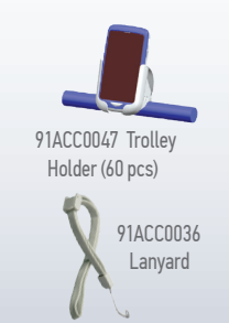
91ACC0047 Trolley Holder (60 pcs) 91ACC0036 Lanyard