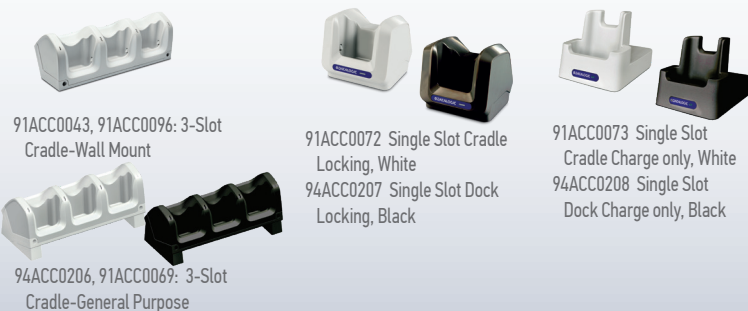
91ACC0043, 91ACC0096: 3-Slot Cradle-Wall Mount 91ACC0072 Single Slot Cradle Locking, White 94ACC0207 Single Slot Dock Locking, Black 91ACC0073 Single Slot Cradle Charge only, White 94ACC0208 Single Slot Dock Charge only, Black 94ACC0206, 91ACC0069: 3-Slot Cradle-General Purpose